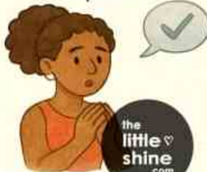
Trying to impress