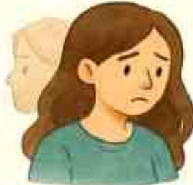
Living in the past