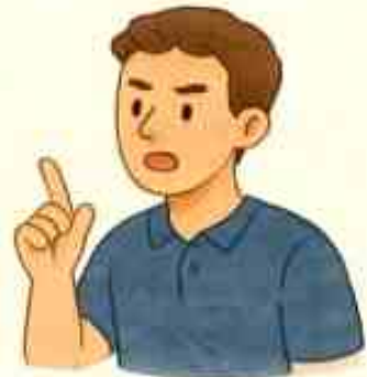
Needing to be right