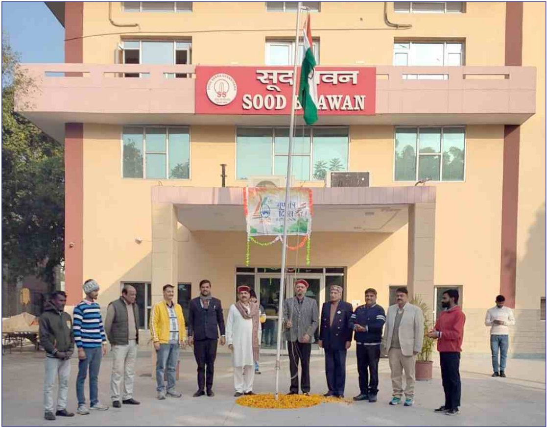
Ceremonial Unfurling of the National Flag — 77th Republic Day Celebrations-2026 at Sood Bhawan, Panchkula.