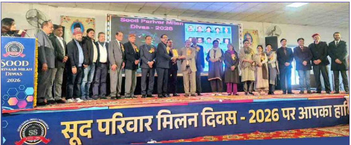
Sood Sabha Chandigarh joins in the Spirit of Unity at Sood Parivar Milan Divas Hosted by Sood Sabha, Hoshiarpur on 18 th January, 2026.